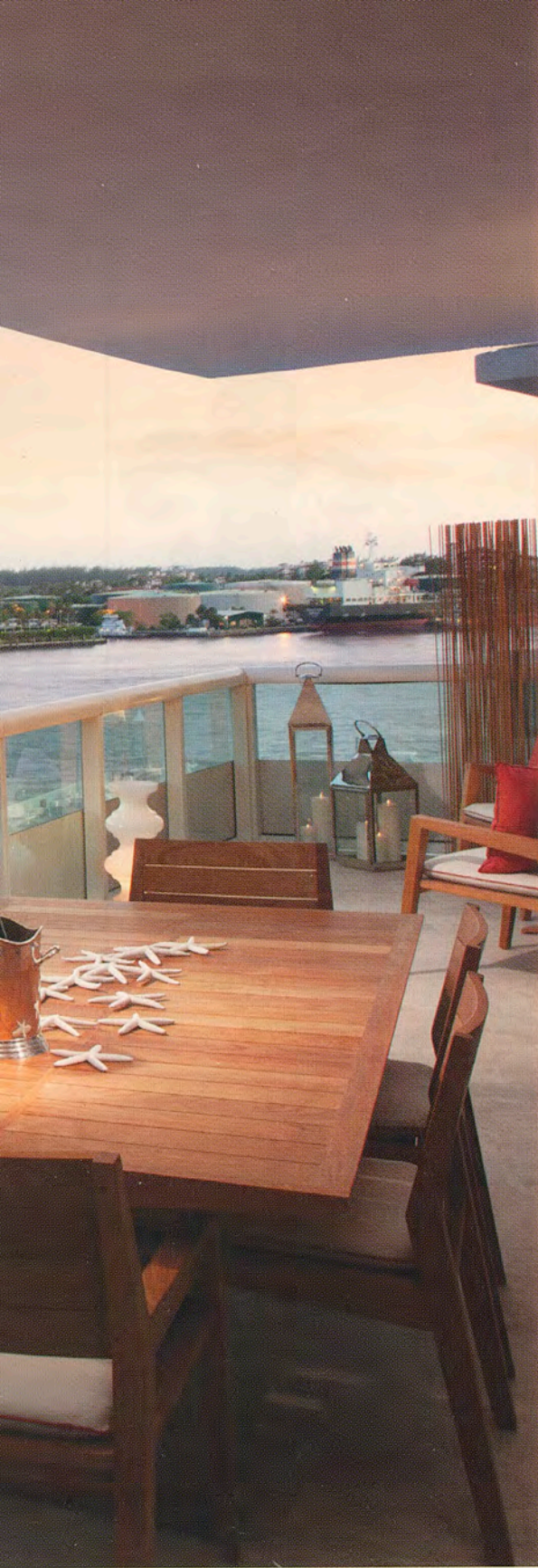
A teak table and six matching chairs on the balcony are perfect for alfresco dining.